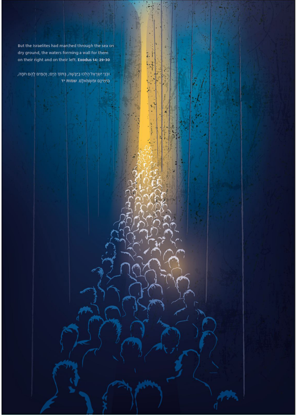
Illustration credit: Ira Ginzburg

light, and quite possibly some heat as well. After all, Jews are a people that have raised arguing to a sacred artform. We hope your experience of Passover this year will be inclusive and incisive, personal and communal, memorable and enjoyable, and consequently, that your relationship to Israel will be closer, stronger and deeper.