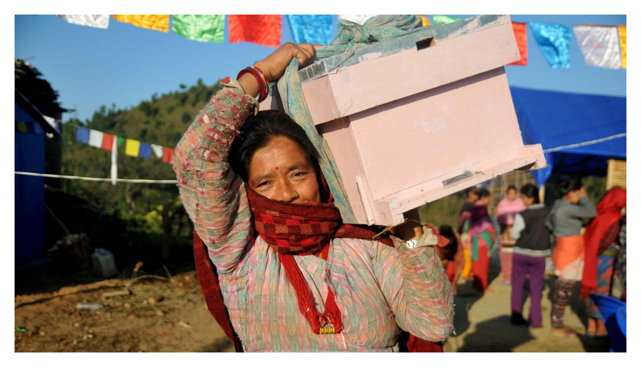
NEPAL, 2016

A woman collects her beehive as part of IsraAID's HoneyAID beekeeping program. HoneyAID empowers local women and provides income generation opportunities in earthquake-affected Nepal villages.