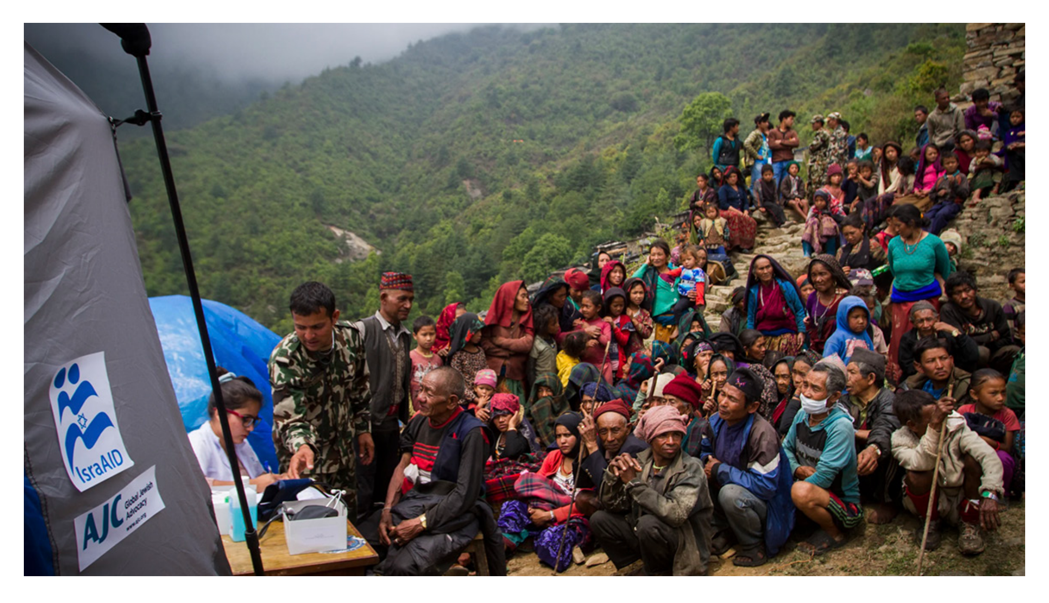
NEPAL, 2015

The 2015 earthquake devastated rural communities in Nepal. IsraAID's medical team worked closely with national authorities to treat patients in hard-to-reach areas.