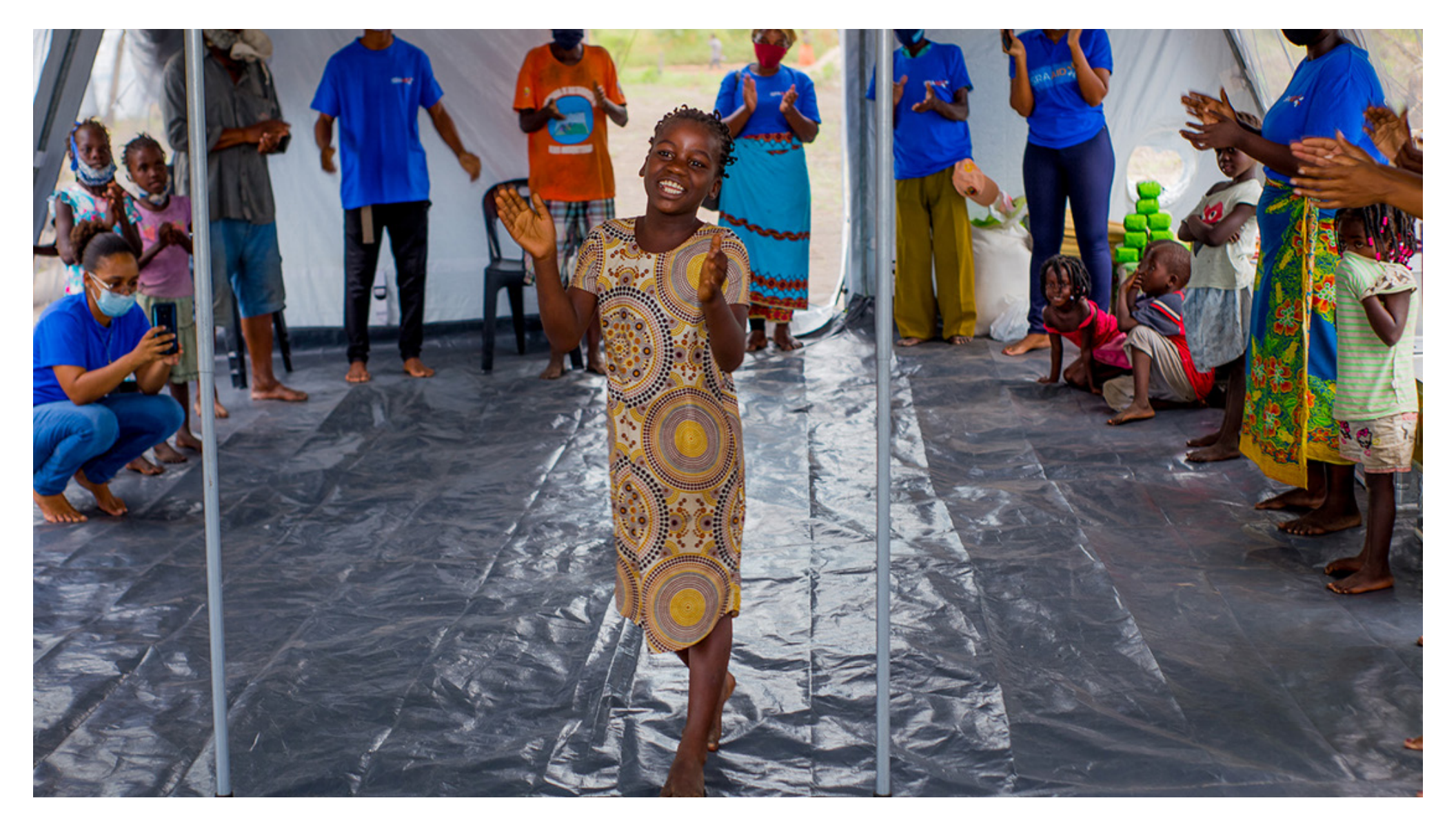
MOZAMBIQUE, 2021

In January 2021, central Mozambique was hit by Cyclone Eloise. Heavy rains brought major flooding, and entire communities were displaced and had to be resettled. Displaced children were left without access to school. IsraAID's team stepped in, operating a daily Child Friendly Space in the community, with informal education, activities, and a hot meal.