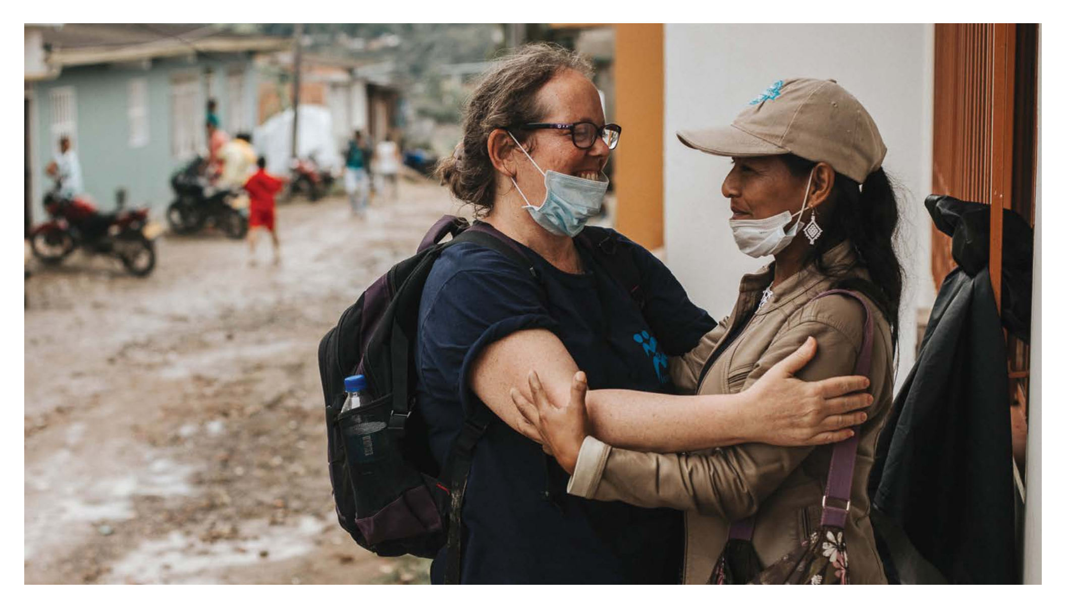
COLOMBIA, 2017

IsraAID's emergency response team in Mocoa following the dramatic mudslides, which left 43,000 people without access to electricity or running water.