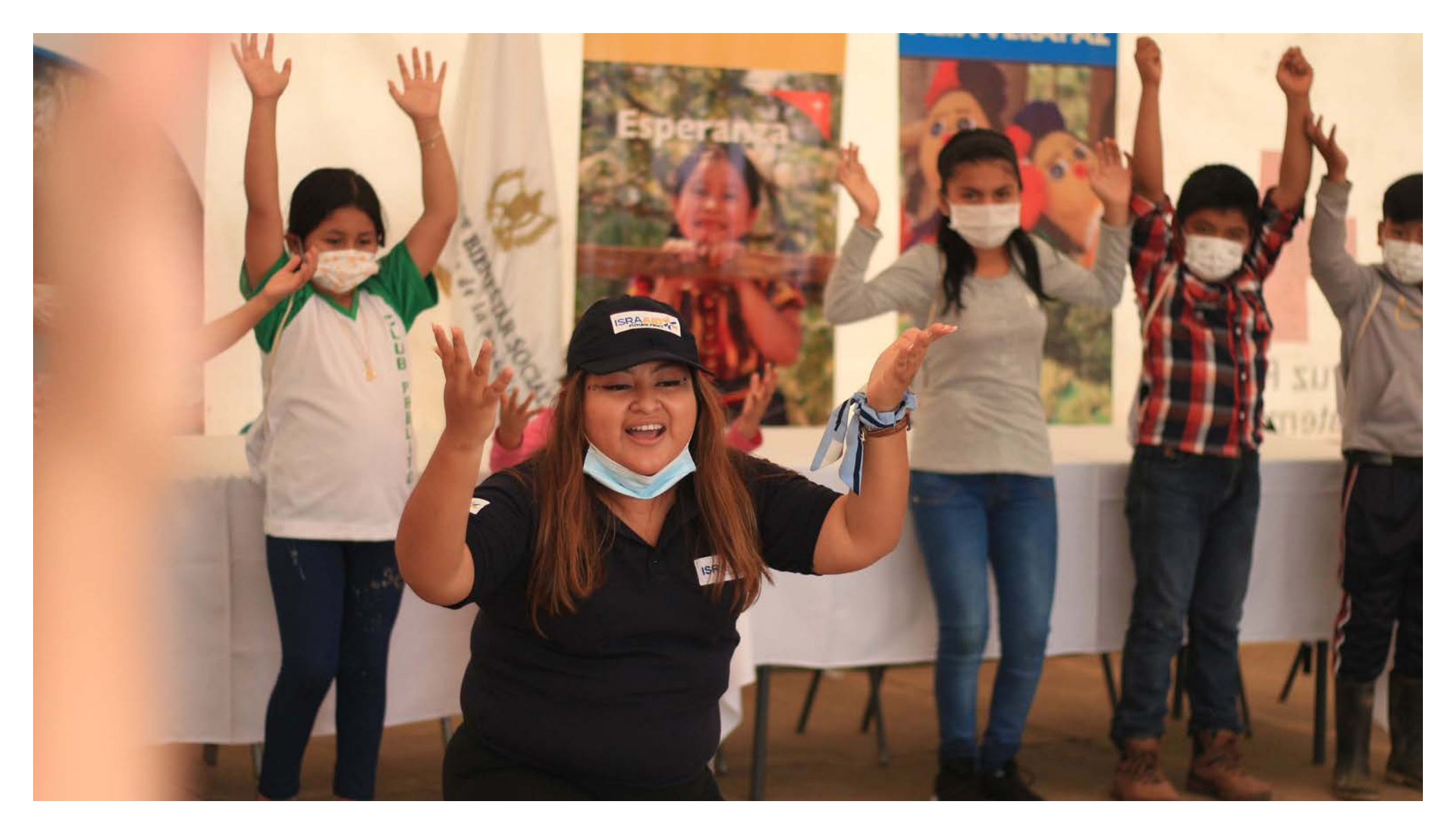
GUATEMALA, 2021

IsraAID partnered with UNICEF to bring child protection activities to communities affected by Storm Eta and Hurricane Iota. Thousands of people were displaced following the storms' torrential rainfall that caused heavy flooding and dozens of landslides and mudflows.