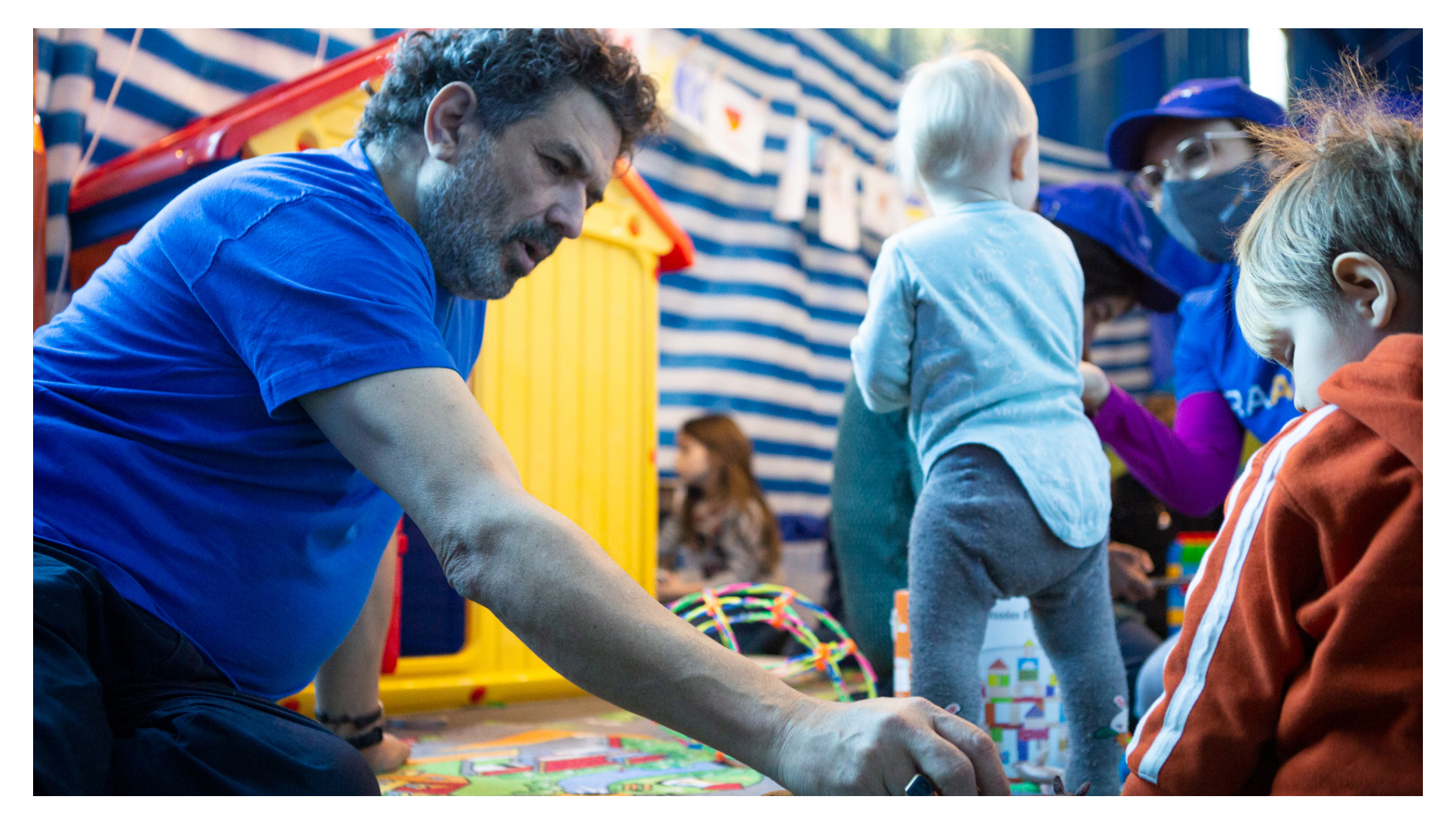
MOLDOVA, 2022

IsraAID & Early Starters International have partnered with a local municipality near the Ukrainian border to create a safe space for Ukranian children fleeing war, with daily activities run by child development specialists and trained local volunteers. Amid the chaos, this space provides a rare opportunity: the chance for kids to "just be kids"—and begin to process their experiences.