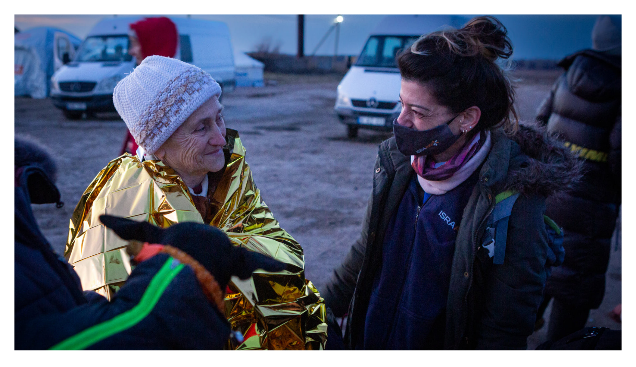
MOLDOVA, 2022

With freezing temperatures at the Moldovan-Ukrainian border, thermal blankets, hats, and other winter weather items are crucial. IsraAID's team provides immediate aid to Ukrainian refugees at the border when they arrive in Moldova—and longer-term support in emergency shelters around the country.