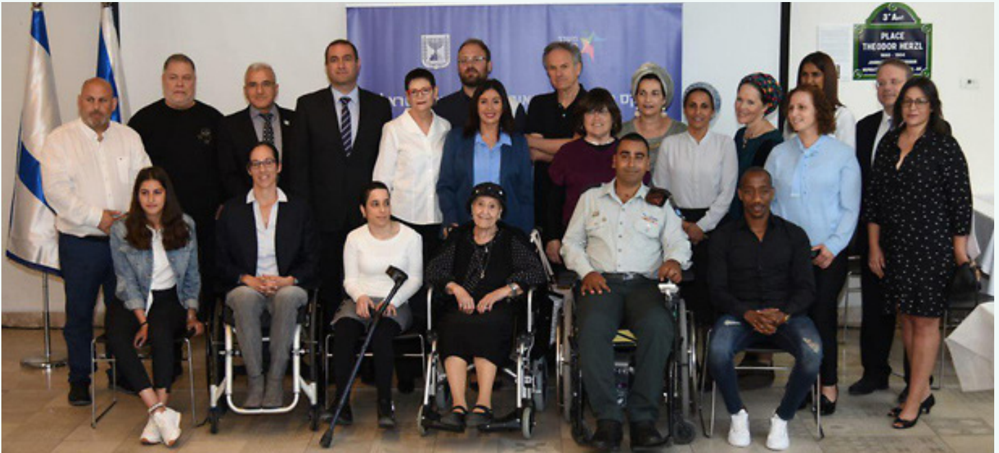
2019 Torch Lighters with Minister of Culture and Sport Miri Regev.

For more information on Miri Regev and Spacell, look to the Israel Resource Cards.